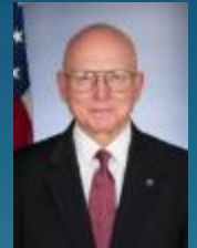
Coordinator of the Chairmanship Special Representative for the Arctic, Admiral Robert Papp