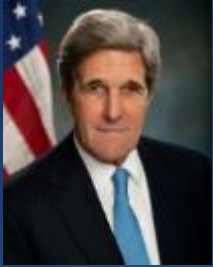
Chair of the Arctic Council Secretary of State John Kerry